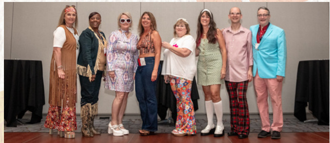
50th Year Anniversary Committee