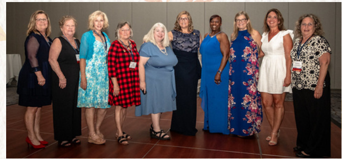
Past Presidents at Banquet